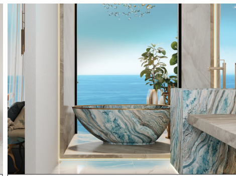
STUDIO (392 SQ.FT) STARTING AED 1.2M